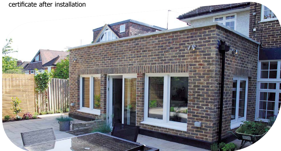
Pilkington energiKare™ Triple