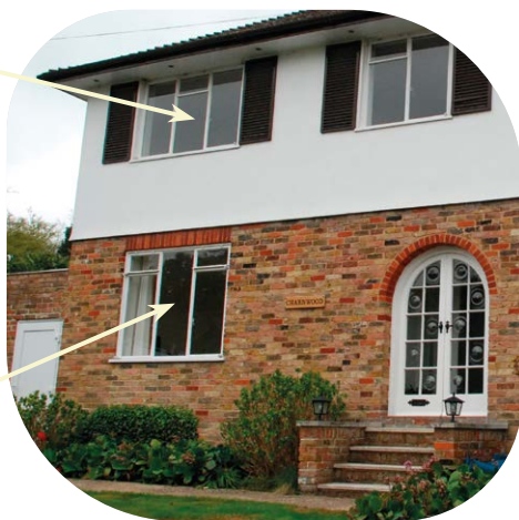
Original single glazed downstairs windows

So choose a product from the Pilkington energiKare™ range today. Visit www.pilkington.co.uk to find a window installer near you.